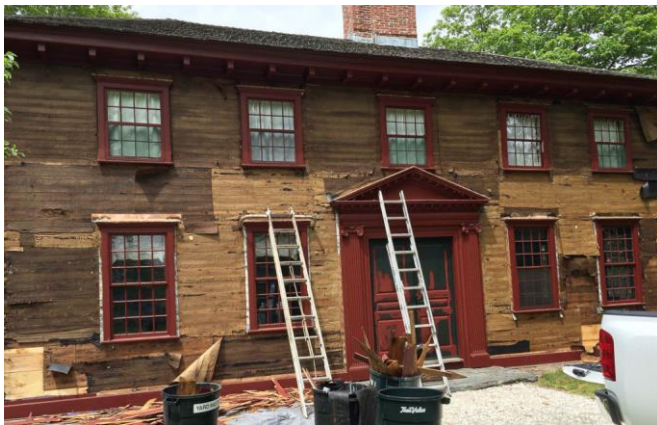
Whitehall receives a facelift with new clapboards, copper topping of windows, and a complete repainting

Last year's plans to convert the attic storage area into a bathroom were postponed to replace rotten boards and clapboard siding and repaint the exterior of the house. Everything looks really nice now, but for the time being, residents will have to trek downstairs to the bathroom.