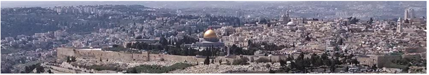
View of Jerusalem (including the Dome of the Rock) from the Mt Scopus campus of the Hebrew University of Jerusalem